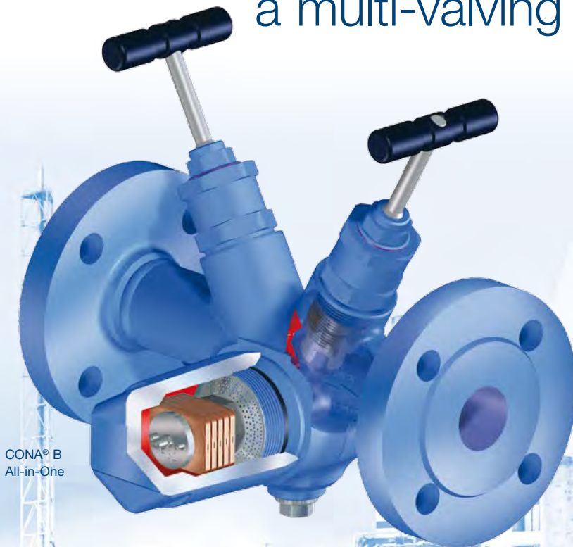
CONA® B All-in-One

Compact condensate discharge in a multi-valving system!