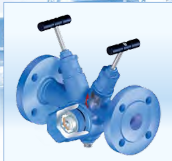
CONA® TD All-in-One