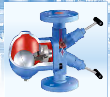
CONA® SC All-in-One

Patented – The integrated system comprises a steam trap, stop valve, strainer, check valve and drain valve! Reduces pipe connections by up to 80% reduction. Now also with DIN face-to-face dimensions!